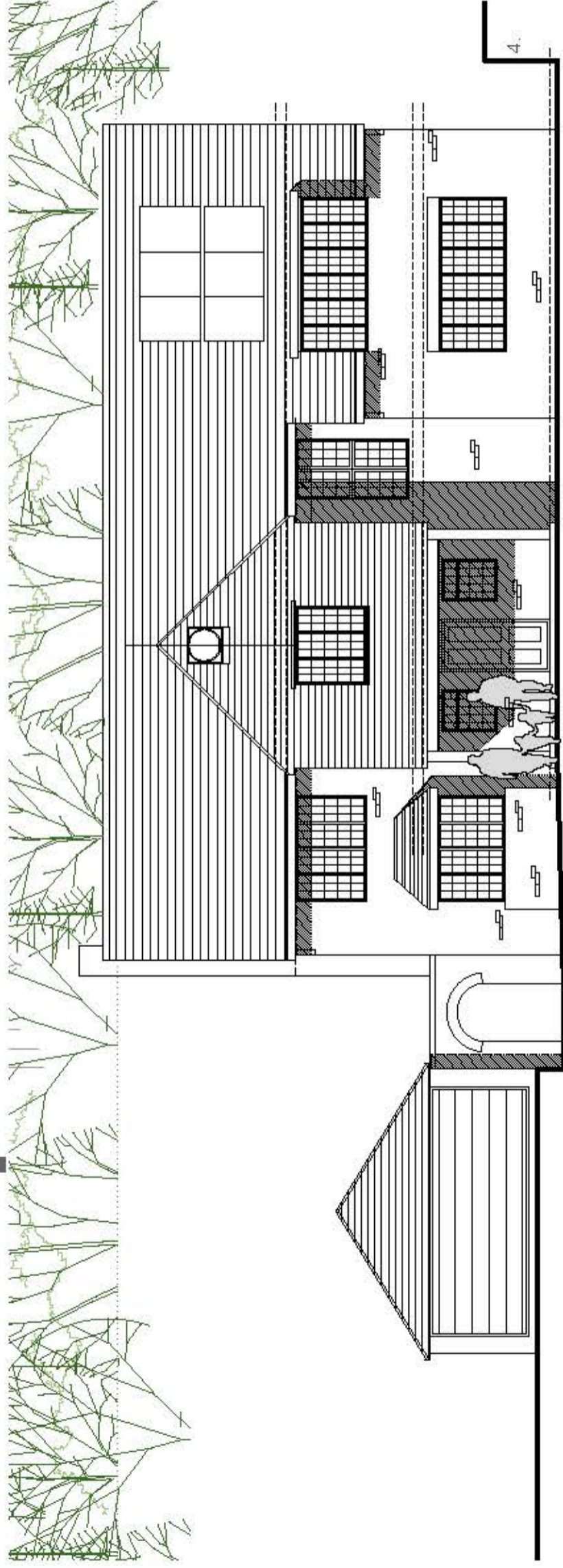
04 Proposed front elevation 1:100